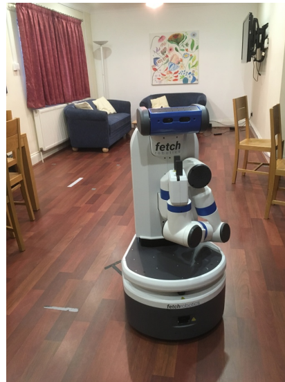
Fig. 3. The Fetch Robot used for the experiment.

Pilot studies have shown that participants notice differences between the Fetch Robot moving with a linear acceleration and a robot moving with the slow in, slow out acceleration, especially when stopping. We have recorded footage of staff participating in the pilot study to be used as the video stimulus for the participant at the end of the experiment. In the ongoing main study, participants so far have commented on how they liked the smoothness of the robot’s movement.